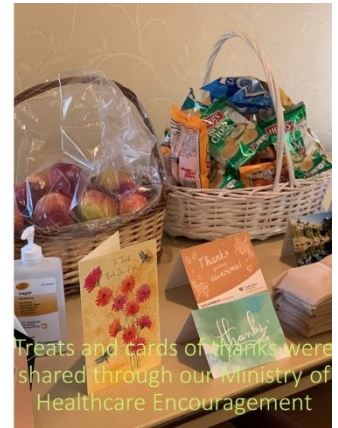
Treats and cards of thanks were shared through our ministry of Healthcare Encouragement

We continued, and this week conclude, our 2021 Ministry of Healthcare Encouragement with a collection of cards, and delivery of goodies to two separate units at Penn State Hershey Medical Center (September and December), the Lebanon Valley Home in Annville (October), and Northern Lebanon Fire and Emergency Services (November). This has been a HUGE undertaking made possible by our Mission Ministry (formerly "Evangelism") Committee, Thrivent Action Team cards, a 2020 grant from our Touching Tomorrow Endowment Fund and by your faithfulness in providing so many cards of support and encouragement. I wish I had kept a count of how many cards we received and distributed, but I'm confident it was at least 250 individual cards. While our healthcare workers received a fair amount of attention at the beginning of the pandemic, many have reported in recent months that support had waned, and so they were especially grateful for our cards and treats. THANK YOU for making this ministry possible.