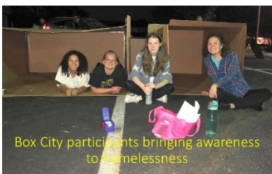
Box City participants bringing awareness to homelessness