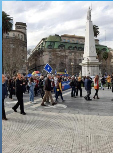
A photo of the abuelas and community members protesting

Once people started to realize that many were being 'disappeared', their mothers and grandmothers (abuelas) joined together to do something about it. They walked in circles around Plaza de Mayo (the plaza in front of the Casa Rosada, the Government House of Argentina) to protest this injustice. They could not stay still and protest or else they would be arrested. I can't even imagine how much courage it took to protest, knowing how dangerous it was to speak out during that time. The love these abuelas showed was so much stronger than any fear they had, and I truly admire that love and loyalty.