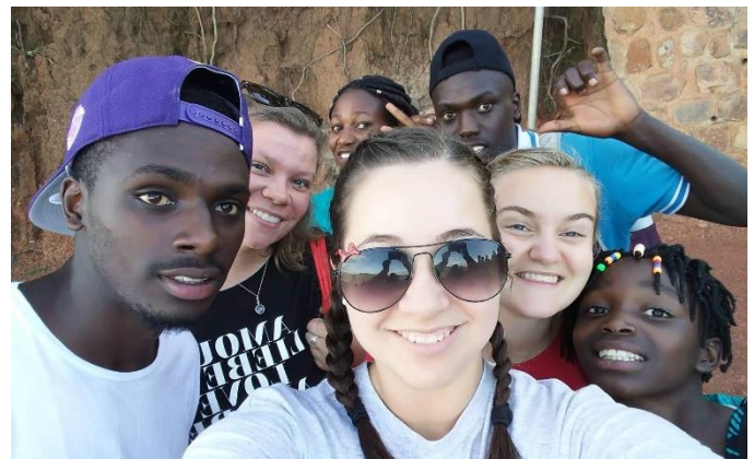
Some of the better pictures from our bus stop photo shoot!