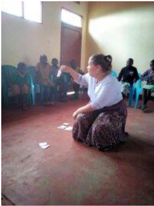
Left: This is my group of P3 and P4 (third and fourth grade) students at the church on Saturday morning. We were learning the names of colors.