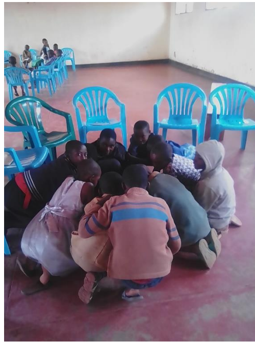
Right: Half of the same group of kiddos—P1 and P2 in the background. The students played memory with the cards I made. They matched the color with the color name.

getting my full attention. I have been helping where I am needed, where the church asks me to be. I have visited sick church members, I have helped plant peas (see my post on the YAGM Rwanda Facebook page!) and I have attended church community meetings. I just started fixing a set of desktop computers